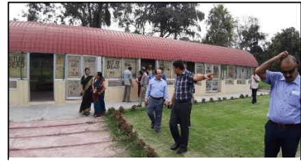
Field Visit to SVPA