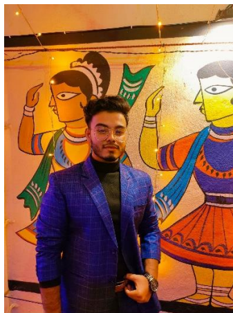
Sayandep Dam Reg. No.: 1012011400104